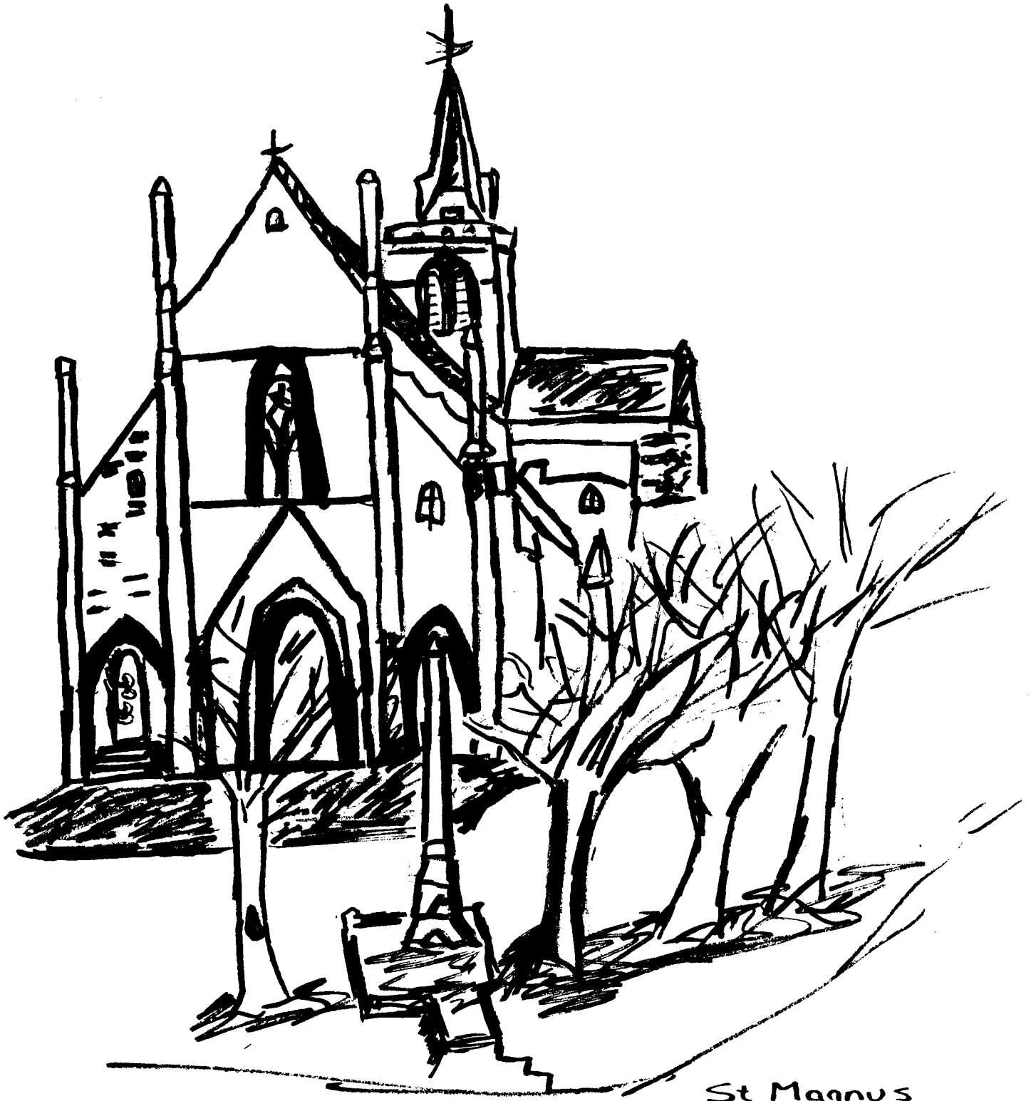
St Magnus Cathedral